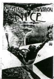
FLIGHT POSTER (1910, THE START OF EXTENDED FLIGHT AND JOURNEYS