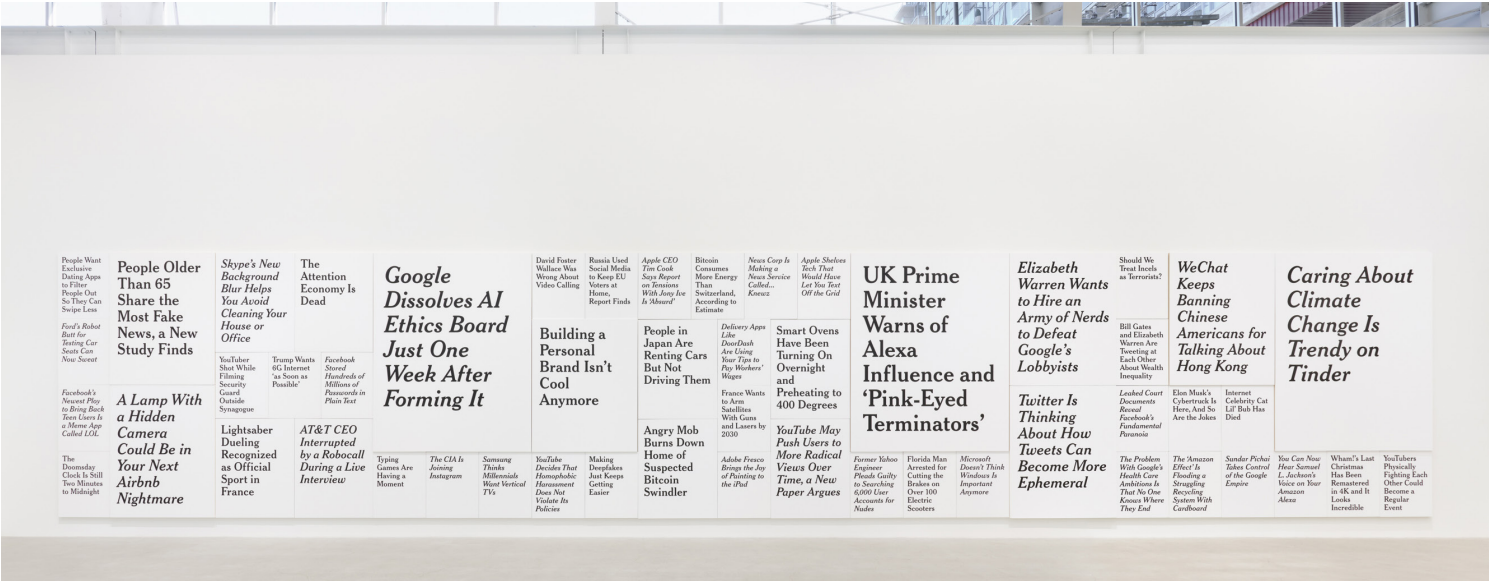
Ron Terada TL; DR, 2019–2020, acrylic on canvas, 52 paintings, 120 x 624 in. (305 x 1585 cm)