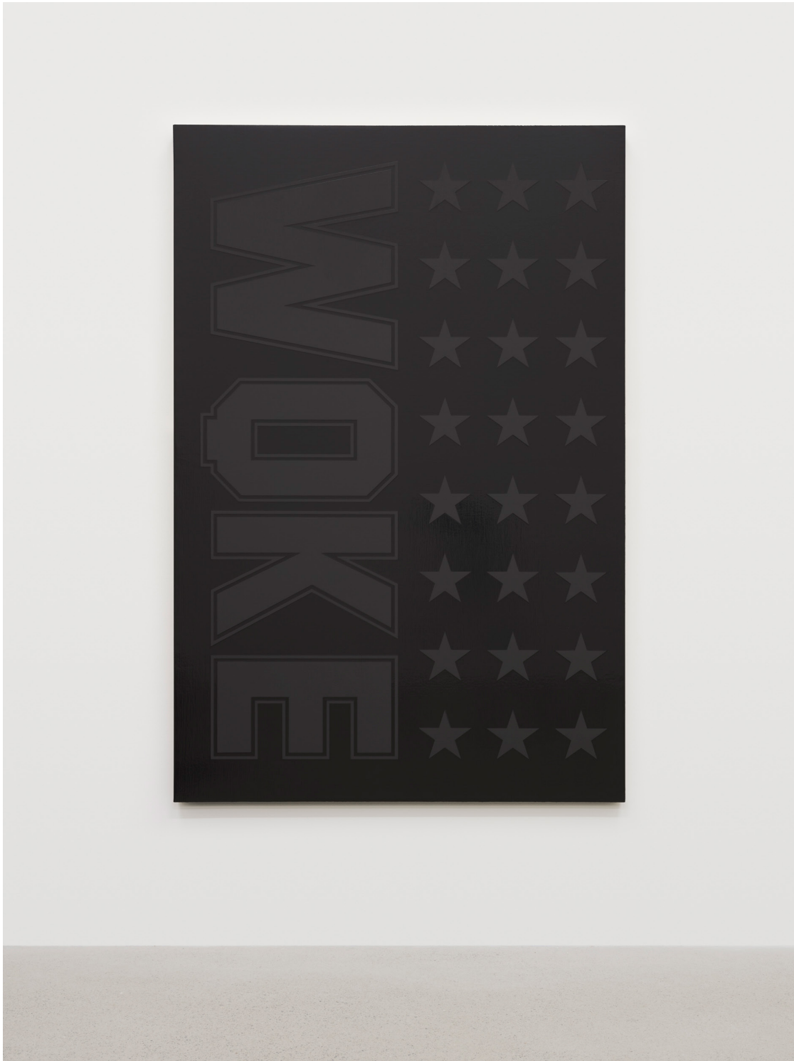
Ron Terada WQKE , 2023, acrylic on linen, 66 x 44 in. (168 x 112 cm)