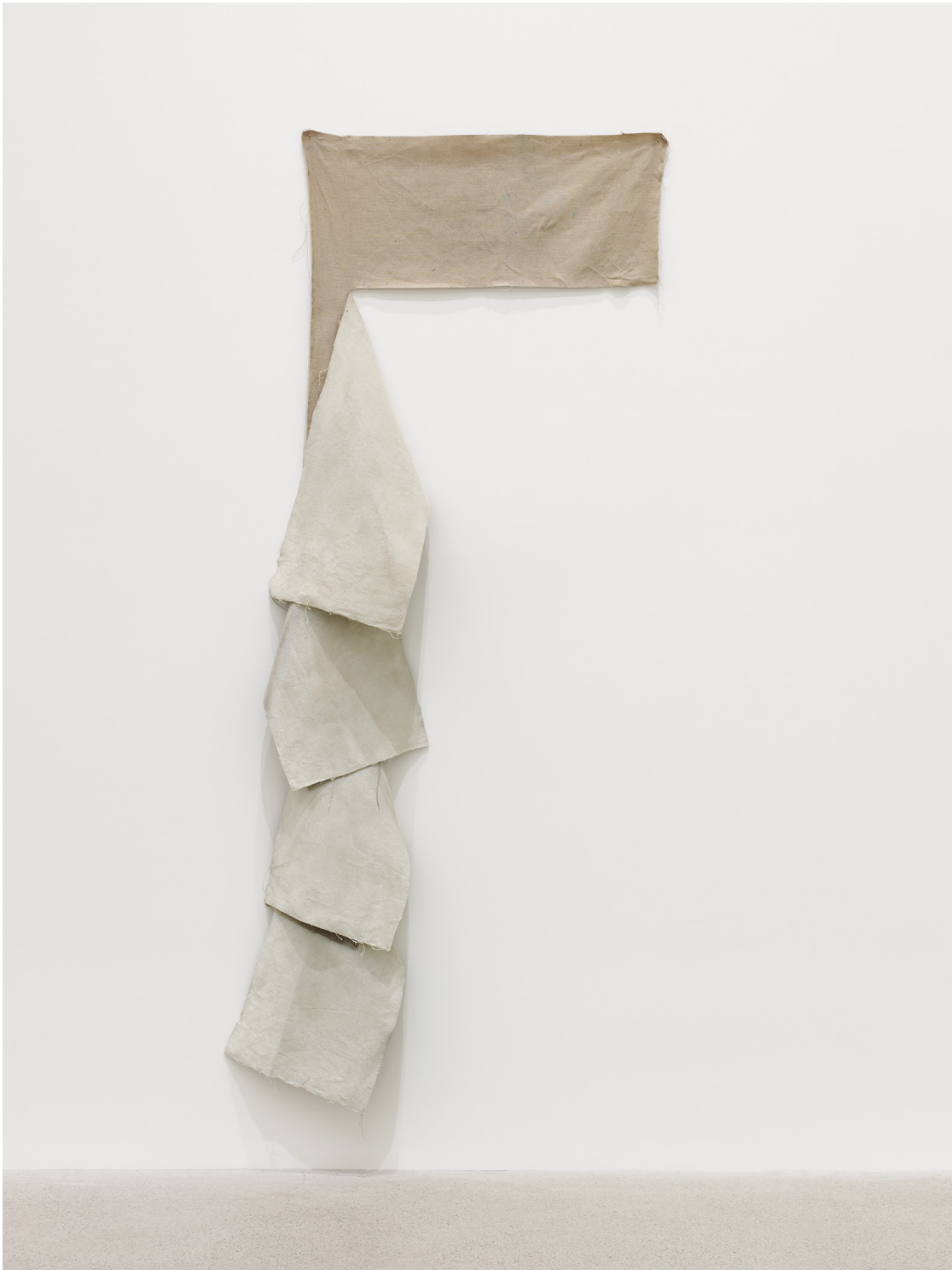
Abbas Akhavan untitled , 2021, spray paint on linen, 79 x 41 x 5 in. (199 x 104 x 12 cm)