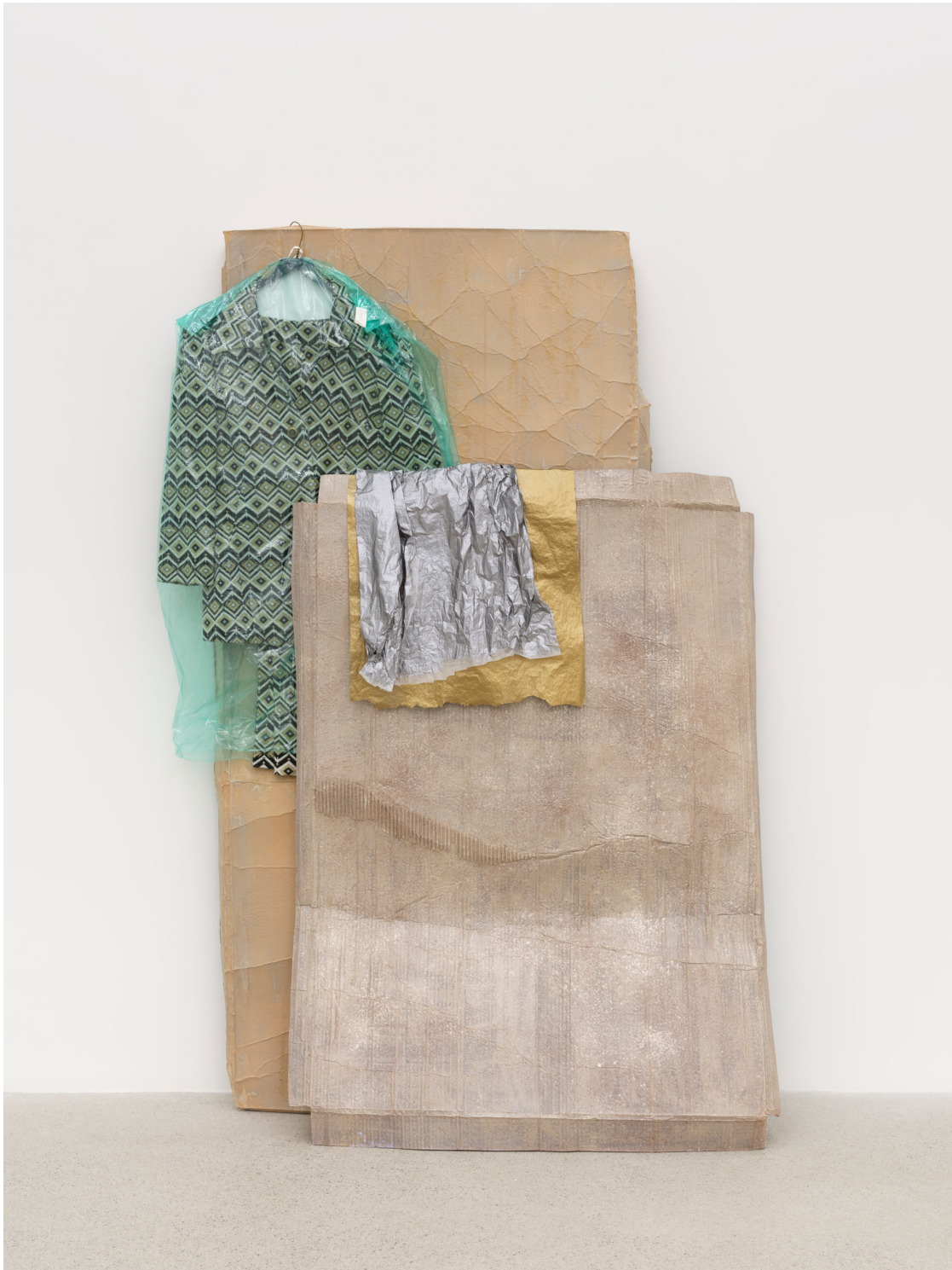
Liz Magor Stretch Fabric , 2016, polymerized gypsum, painted glassine, plastic, fabric, 73 x 48 x 15 in. (185 x 122 x 38 cm)