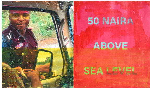
Chukwudubem Ukaigwe, Power Play 1, 2022, Photo Painting Photo Gel Transfers and Acrylic Paint on Canvas, 13 x 22 cm.

Chukwudubem Ukaigwe (b. 1995) is a Nigerian-born interdisciplinary artist based in Canada. Working across a variety of mediums -specifically paintings, ceramics, sounds, sculpture, assemblage, film and performance-, Ukaigwe approaches his practice as a process of thinking through ideas. His process is interwoven with his desire to remain in the nowness of his work as he unveils his ideas, creating a narrative in his own language from the start to the (inevitable) end.