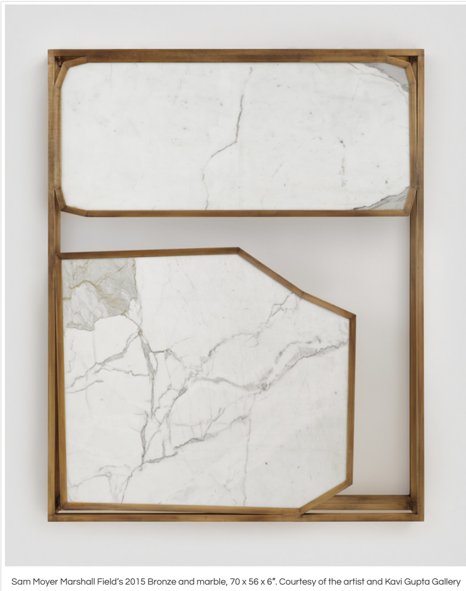
Sam Moyer Marshall Field's 2015 Bronze and marble, 70 x 56 x 6".

ASSISTED guides us along the tightrope between the expected and the divergent.