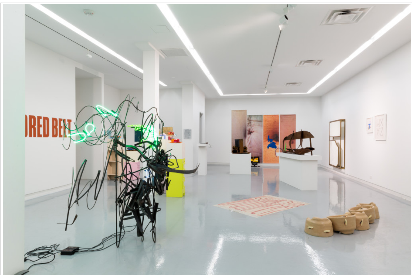
ASSISTED, Installation view.