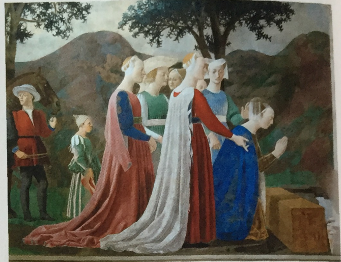
Piero della Francesca, Legend of the True Cross c1452 fresco cycle, detail showing the Queen of Sheba in adoration of the Wood with handmaids, Church of San Francesco, Arezzo

The Golden Stairs 1880 is on view at Tate Britain. Nude Descending a Staircase (No.2) 1912 is now in the collection of the Philadelphia Museum of Art. Emily Carr's work is held in various Canadian collections.