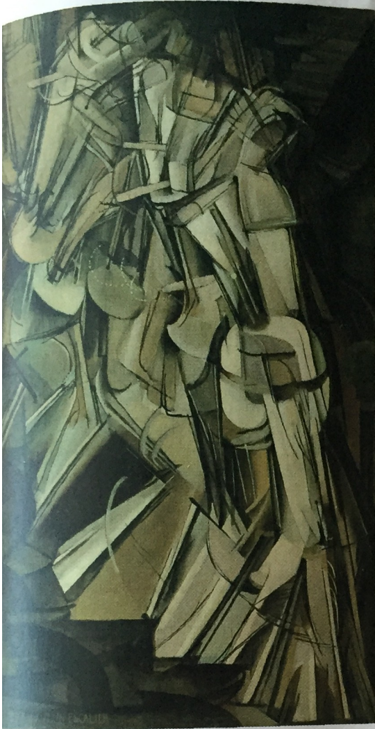
Marcel Duchamp, Nude Descending a Staircase (No. 2) 1912, oil on canvas, 147 x 89.2cm