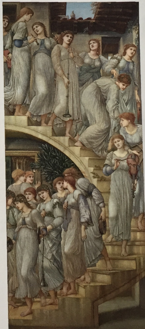
Edward Burne-Jones, The Golden Stairs 1880, oil on canvas, 269.2 x 116.8 cm