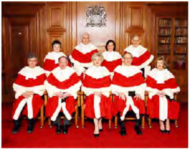
Supreme Court of Canada, Ottawa

traditional décor such as red carpet, and wood grain judges bench—to maintain a sense of authority and decorum amidst a new order of technology and information. The official description of the court proudly emphasizes the technological infrastructure of the built environment.