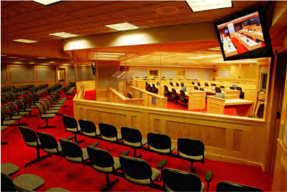
Courtroom 20, Vancouver