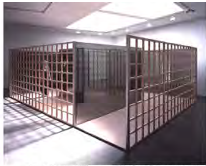
Dan Graham. Greek Meander Pavilion, Open Shoji Screen Version, 2001. Courtesy of the artist and Lisson Gallery, London

Dan Graham has worked extensively in performances, films, video installations and sculptural environments built from glass and reflective materials. These works are instructive for the court which makes increasing use of real time video and glass dividers while actively attempting to eliminate (or disavow) any of the time space ego displacements which Graham's works initiate. Graham's works with glass needs to be understood as a kind of condensation of his earlier works with real time video. For Graham glass, mirror and video function as divider-connectors, they can variously alienate and encourage identification. In Cinema (1981), the artist imagines a cinema with a screen of two-way glass. Instead of enjoying the isolation of the cinema, when the lights are on in the cinema the audience is on display to the passersby