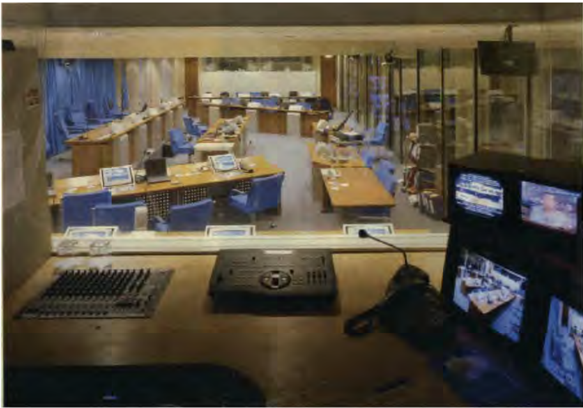
International Criminal Tribunal for the Former Yugoslavia Courtroom, 2003

of art and theories of representation rather than just a received response to “practical” technological necessities which will reproduce a television studio ideology as well as aesthetic. 13