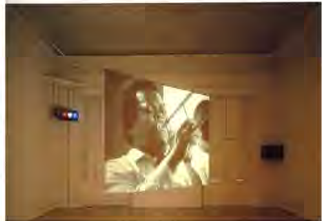
Stan Douglas, Hors-champs , 1992 Installation shot, Institute of Contemporary Arts, London, 1994

Windows in architecture mediate separated spatial units and frame a conventional perspective of one unit’s relation to the other, mirrors in architecture define, self reflectively, spatial enclosure and ego enclosure. Architecture defines certain cultural and psychological boundaries; video may intercede to replace or rearrange some of these boundaries.” 16