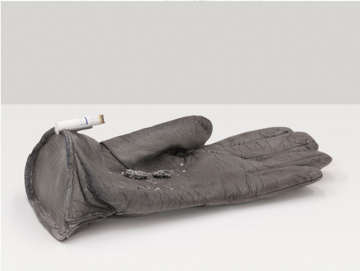
Liz Magor, Leather Palm , 2015–2019, polymerized gypsum, copper, cigarette, 8 × 25 × 11 cm.