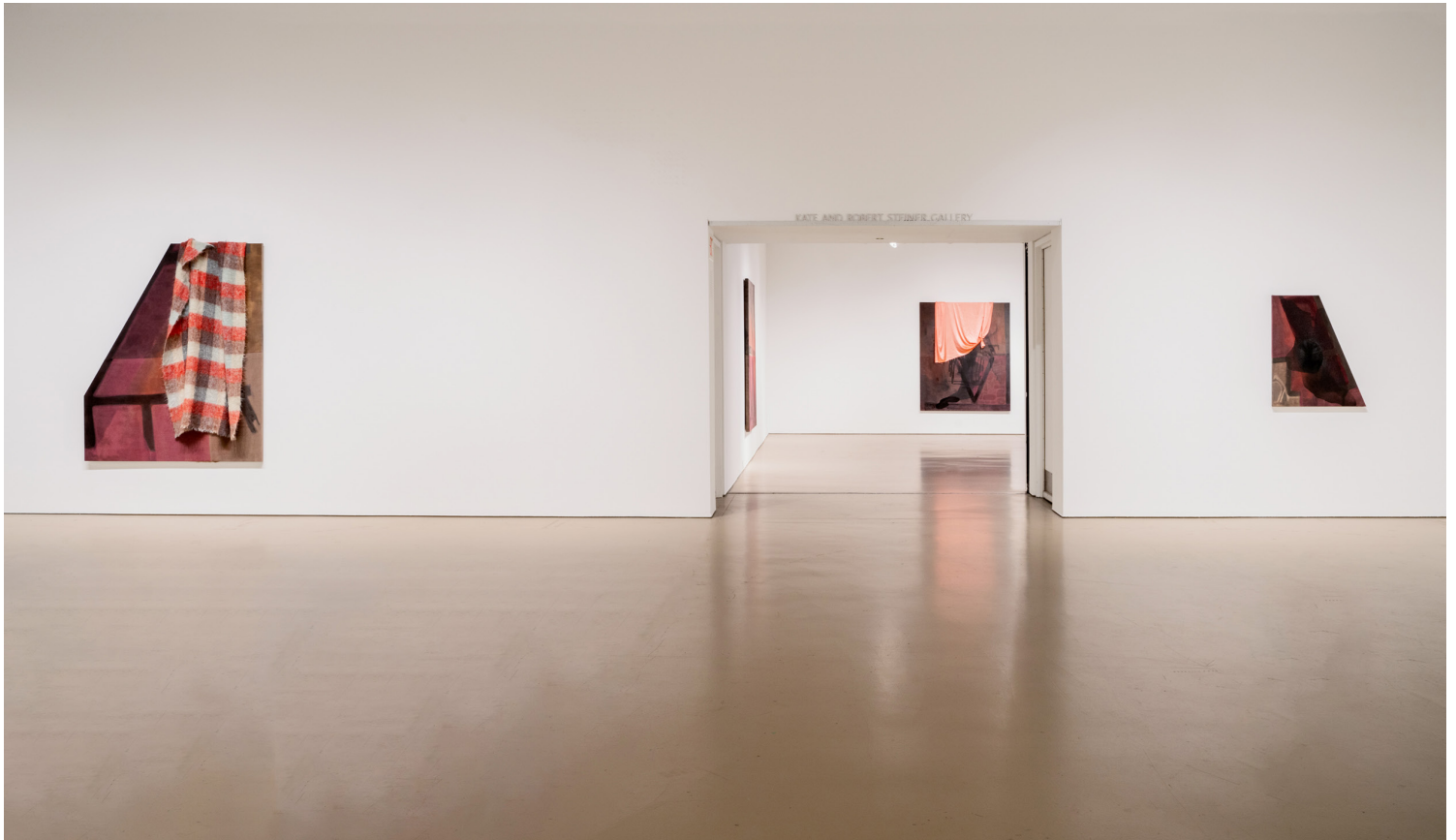
Duane Linklater Installation view, they have piled the stone / as they promised / without syrup , Art Gallery of Hamilton, Canada, 2023