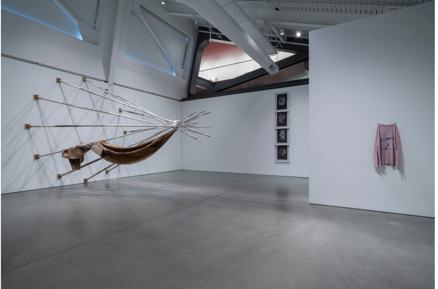
Duane Linklater Installation view, mymothersside , BAMPFA, Berkeley, USA, 2023