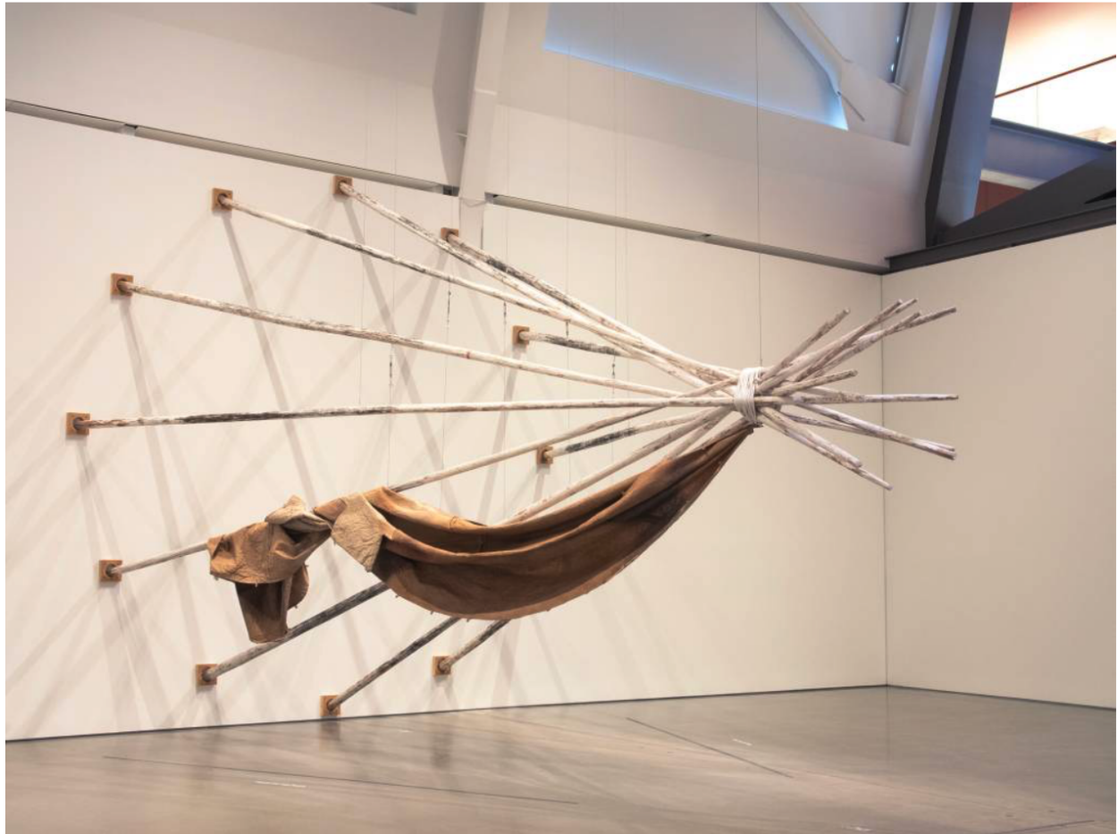
Installation view of Duane Linklater's 'dislodgevanishskinground,' on view in 'mymothersside' at BAMPFA. (Daria Lugina)

When you first turn into the Berkeley Art Museum and Pacific Film Archive 's main exhibition space, watch your head. Jutting out from the wall sideways, in a splay of tapered wooden pole-ends, is a massive tepee — or at least the bones of one. The sumac-dyed canvas that might otherwise enfold the structure drapes over one side. What remains are the poles, knotted together near their tips and painted a streaky, ashen white.