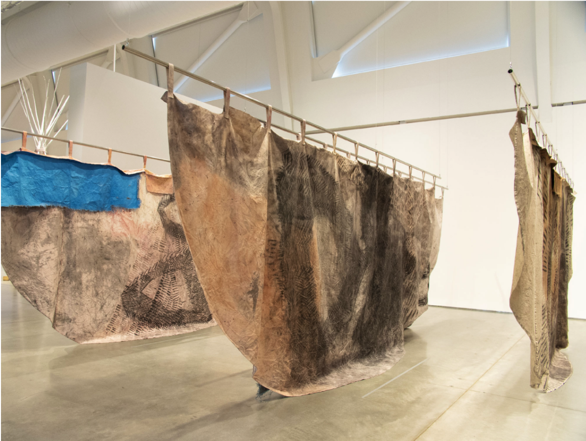
Installation view of 'wintercount_215_kisepîsim, mistranslate_wolftreeriver_ininîmowinîhk' in 'mymothersside' at BAMPFA.

mymothersside , BAMPFA's survey of Linklater's work from the last decade, serves as an excavation of these memories. It includes some 30 pieces in sculpture, painting and film, as well as one permanent architectural installation. Linklater composed almost all of the works from materials important to his and other Native cultures: animal hides, saplings, sumac, cochineal and charcoal. (These material choices render one major outlier — a series of colorless 3D-printed replicas of Indigenous artifacts from the Utah Museum of Fine Arts in Salt Lake City — utterly lifeless by comparison).