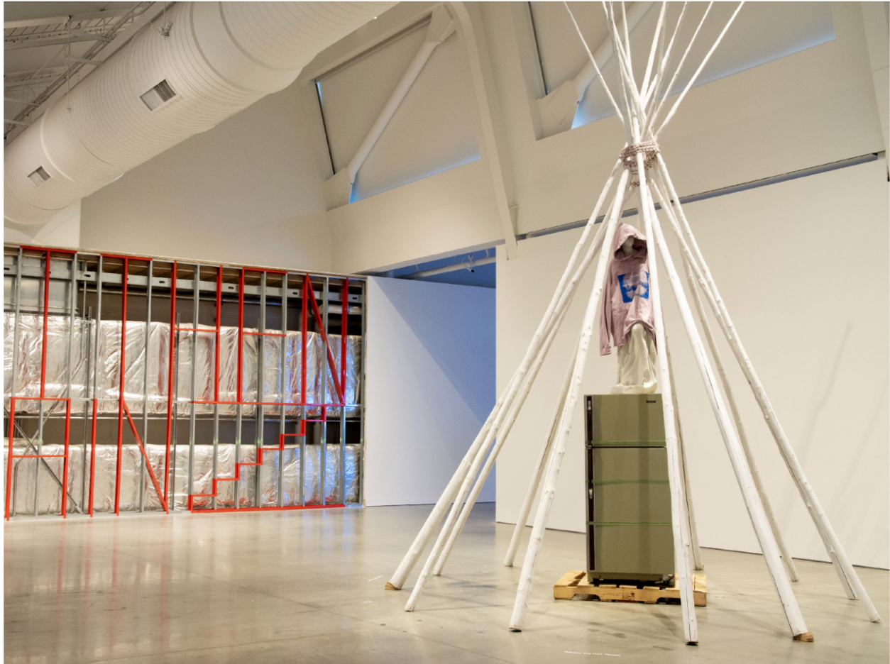
Installation view of 'mymothersside' at BAMPFA with 'What Then Remainz' in the background. (Daria Lugina)

And in case this institutional duty was unclear, mymothersside includes a brasher approach. Linklater's installation What Then Remainz required BAMPFA to deconstruct the exhibition's far wall, stripping it to its metalwork and insulation. The museum had to then rearrange the steel framing and use red acrylic paint to spell out the titular phrase, borrowed from a controversial United States Supreme Court decision determining the jurisdiction of tribal lands. When the exhibition is over, drywall will be reapplied over the framing, leaving the phrase in place indefinitely.