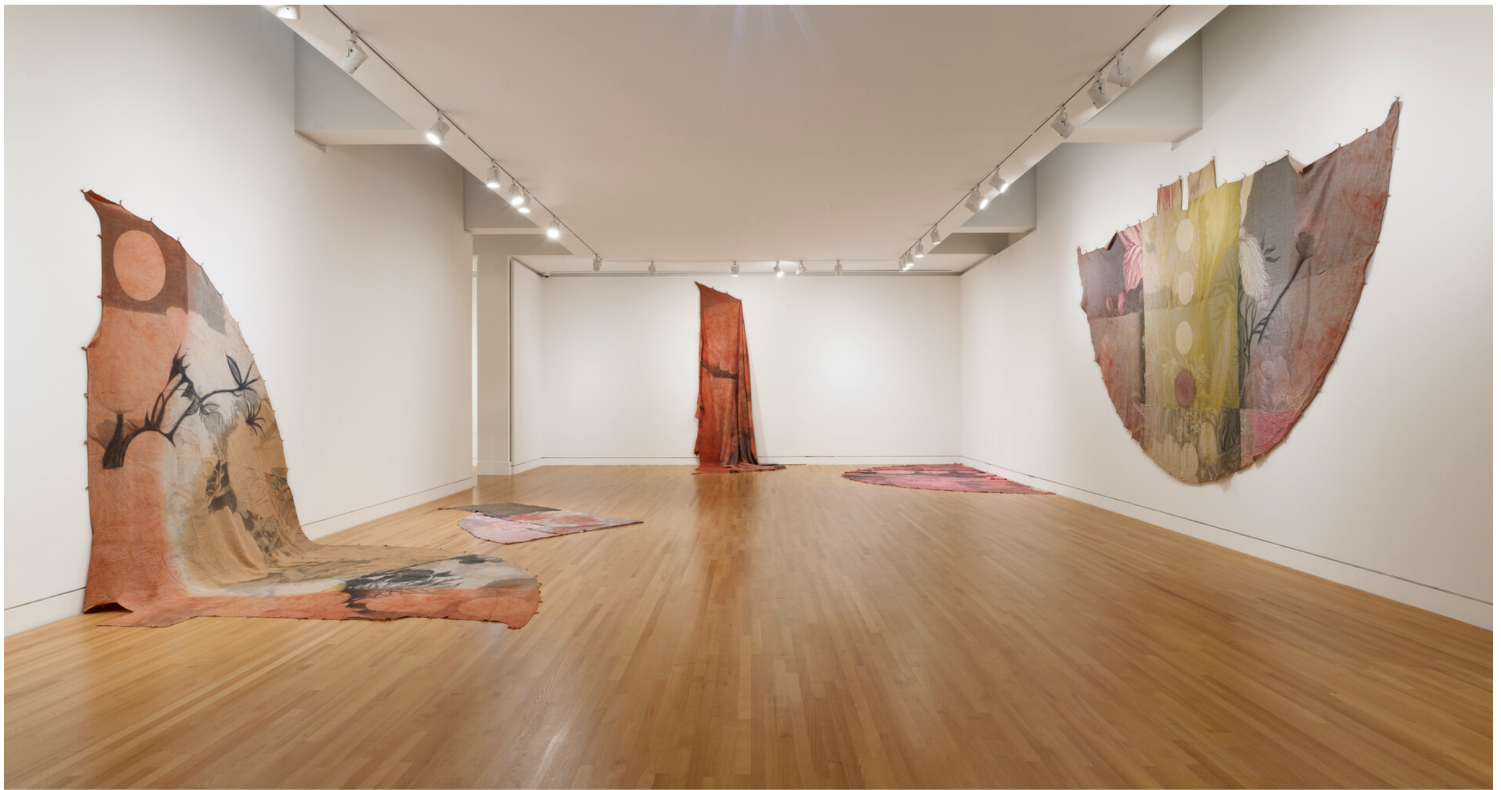
Duane Linklater, can the circle be unbroken 1-5 , 2019. Installation view, mymothersside , Frye Art Museum, Seattle, 2021. Collection SFMOMA.

University of California, Berkeley Art Museum and Pacific Film Archive (BAMPFA)