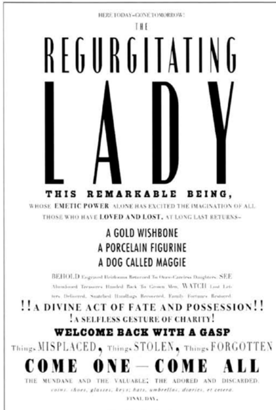
Figure 5. Janice Kerbel, Remarkable: Regurgitating Lady , 2007. Silkscreen on campaign poster paper, 165.5 x 114.5 cm.

developments. Within most movements of the twentieth-century avant-garde, written language was reinvented as a medium, and along with it the visual potential of the word. 3 “We now assume the verbal to be an integral part of the visual,” 4 writes Judi Freeman on the impact of the Dada and Surrealist word-image. Indeed, as curator Bernice Rose proposes, Marcel Duchamp may be the first Conceptual artist for “his use of language images married to visual ones.” 5 Freeman’s suggestion invites the questions: Is the inverse true of art today? Is the visual inherent in the word?