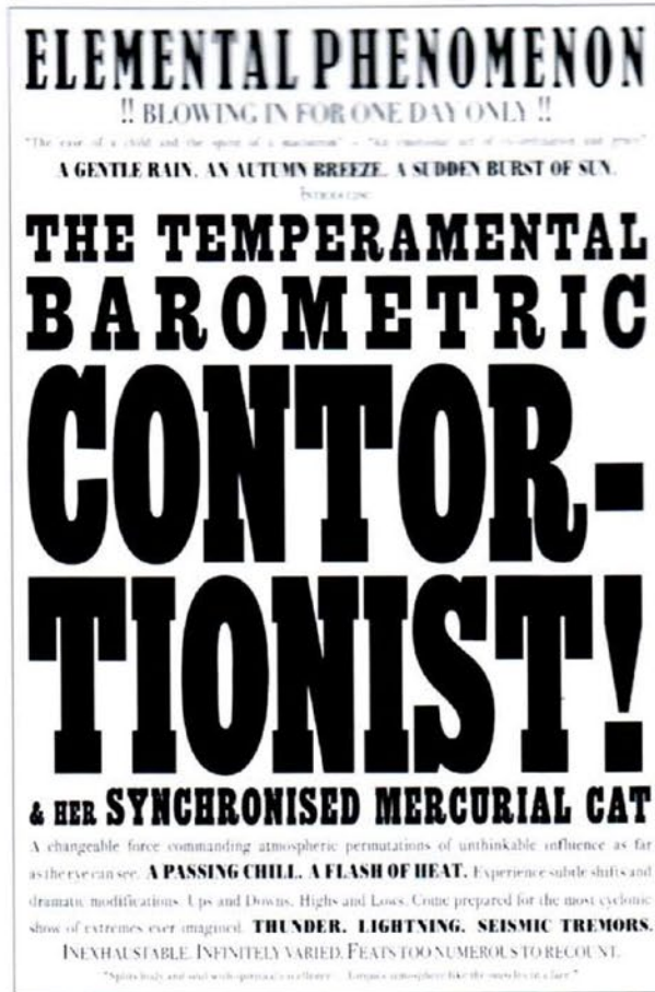
Figure 3. Janice Kerbel, Remarkable: Barometric Contortionist , 2007. Silkscreen on campaign poster paper, 165.5 x 114.5 cm.

Janice Kerbel uses the visual quality of written language to create an experiential artwork that is open to the audience's interpretation due to the effable nature of language as a medium. The "writerly" 1 experience of Kerbel's art highlights the subjectivity of the work, and in turn, the translation from the artist's intention to the audience's reception. By examining the translations occurring within the artwork, I demonstrate that Kerbel participates in a movement in contemporary practice that traces a trajectory back to Conceptual art, but that engages text in a new and unique way. I attempt to locate in Kerbel's work precisely when the words cease to act as text and begin to operate as image. By discussing the way in which Kerbel uses typography 2 to give complex text a particular visual, material dimension, I will address the broader contextual implications for modes of production and display of contemporary text-based art. My interest is not in the typographical