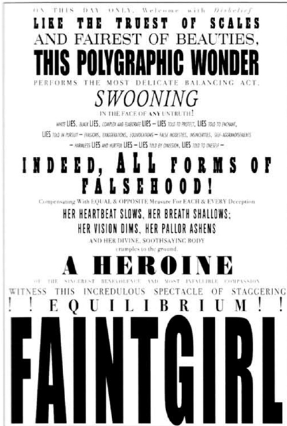
Figure 4. Janice Kerbel, Remarkable: Faintgirl , 2007. Silkscreen on campaign poster paper, 165.5 x 114.5 cm.