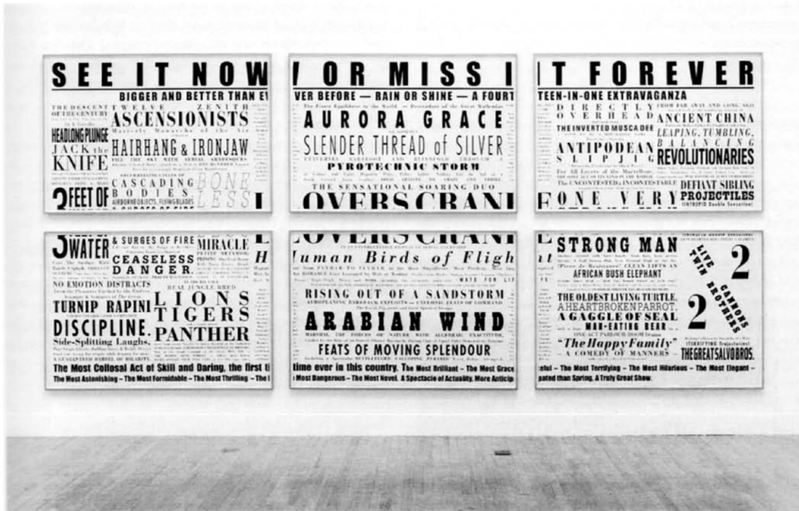
Figure 8. Janice Kerbel, Remarkable (installation), 2010, Tate Britain, London (Photo: Polly Braden. Courtesy of greengrassi, London).

continues, "A term taken out of its normal context of use and resituated onto a blank page, for instance, or the wall of a gallery can do something else entirely." 30 One thing it can do is to become an image. Language in text-based art offers the potential to point us at an idea, and then move beyond that specificity to a potential defined by each reader. The visuality of the word enables this process. Smithson stated, "Look at any word long enough and you will see it open up into a series of faults, into a terrain of particles each containing its own void." 31 To Smithson, words were physical matter, and spaces were physical gaps between them. The sculptural potential of Kerbel's work lies in these gaps. 32