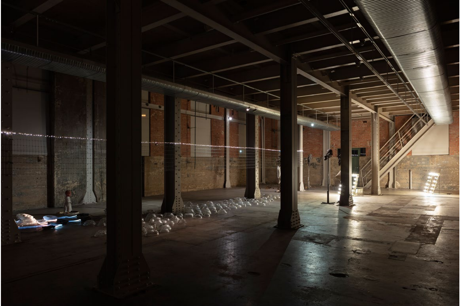
Rochelle Goldberg Installation view, born in a beam of light , The Power Station, Dallas, 2019