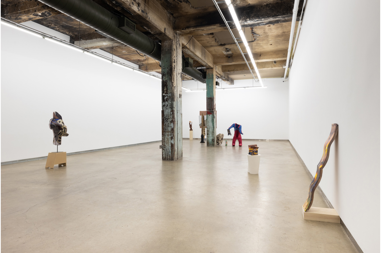
Valérie Blass Installation view, This Is Not A Metaphor , Fonderie Darling, Montreal, 2023