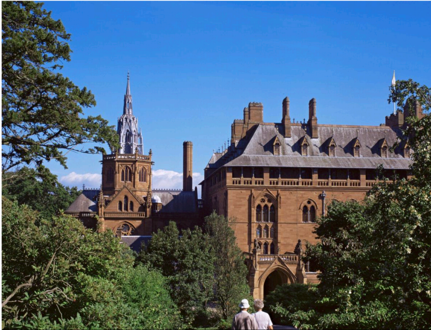
Mount Stuart is the historic seat of the marquis of Bute on the Isle of Bute