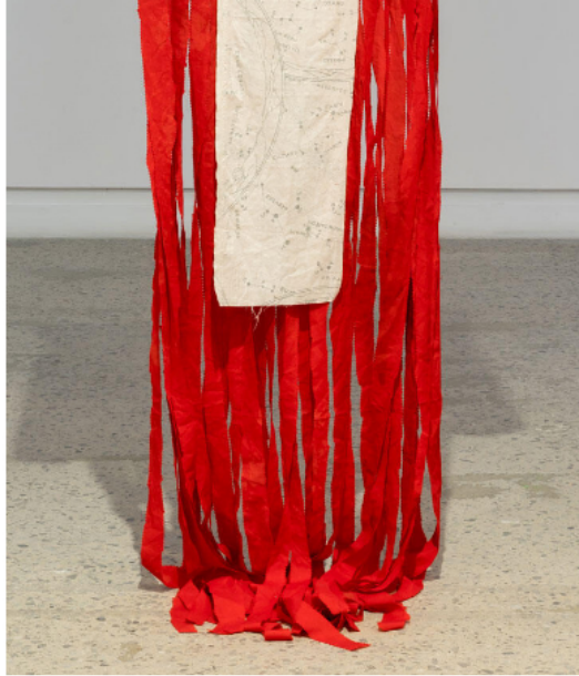
BUSH Gallery, Pocket Guide-vest Power Pocket, 2021, installation view, presented at OPTICA, Montreal, as part of MOMENTA 2021. Courtesy: the artists and OPTICA, Montreal