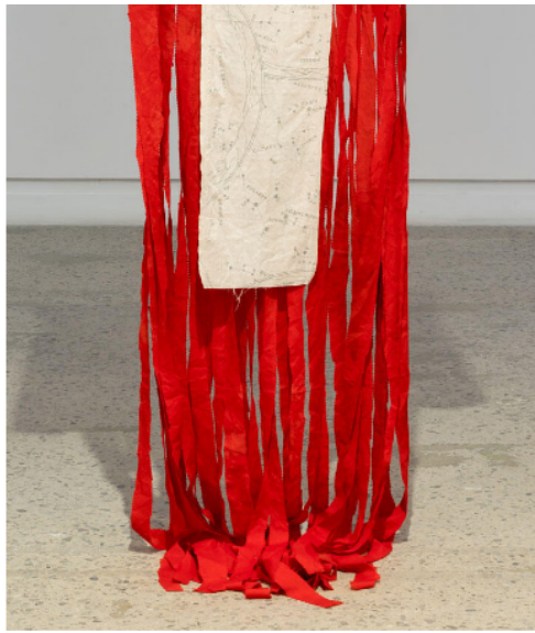
BUSH Gallery, Pocket Guide-vest Power Pocket, 2021, installation view, presented at OPTICA, Montreal, as part of MOMENTA 2021. Courtesy: the artists and OPTICA, Montreal