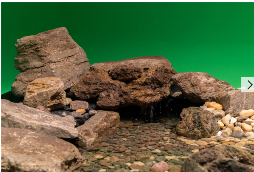
Abbas Akhavan, spill , 2021. Installation view, PHI Foundation, MOMENTA 2021, Montreal.

Several strong solo projects conceive immersive, neon-hued environments to different ends. In Anne Duk Hee Jordan's deep blue room at the Musée des beaux-arts Montréal, extreme video close-ups of underwater oddities enveloped mechanical Critters and Clapping Clams , both 2018, whose unpredictable sounds punctuate the bewildering and at times claustrophobic feeling of life below the surface. Abbas Akhavan's spill , 2020, at Phi Foundation—a deceptively simple rock pond and waterfall installed on a chroma-key green stage—highlights the mediated quality of contemporary experiences of nature as paradoxically meditative and anxiety-making, a feeling further provoked by the slow, persistent drip of water from the gallery's ceiling. At Galerie B-312, Chloë Lum and Yannick Desranleau's Technicolor prosthetic sculptures augment a four-song "meta-musical" performance based on the plant life of Rio de Janeiro. A treatise on chronic illness and the body emerged through an imagined epistolary exchange with Brazilian writer Clarice Lispector—a refreshing departure from the biennial's dominant motif of interspecies sensing.