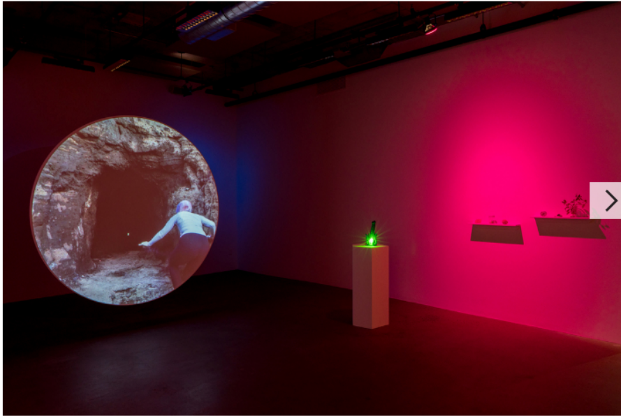
View of "New Red Order: The Last of the Lemurians," 2021. Centre CLARK, MOMENTA 2021.

Several strong solo projects conceive immersive, neon-hued environments to different ends. In Anne Duk Hee Jordan's deep blue room at the Musée des beaux-arts Montréal, extreme video close-ups of underwater oddities enveloped mechanical Critters and Clapping Clams , both 2018, whose unpredictable sounds punctuate the bewildering and at times claustrophobic feeling of life below the surface. Abbas Akhavan's spill , 2020, at Phi Foundation—a deceptively simple rock pond and waterfall installed on a chroma-key green stage—highlights the mediated quality of contemporary experiences of nature as paradoxically meditative and anxiety-making, a feeling further provoked by the slow, persistent drip of water from the gallery's ceiling. At Galerie B-312, Chloë Lum and Yannick Desranleau's Technicolor prosthetic sculptures augment a four-song "meta-musical" performance based on the plant life of Rio de Janeiro. A treatise on chronic illness and the body emerged through an imagined epistolary exchange with Brazilian writer Clarice Lispector—a refreshing departure from the biennial's dominant motif of interspecies sensing.