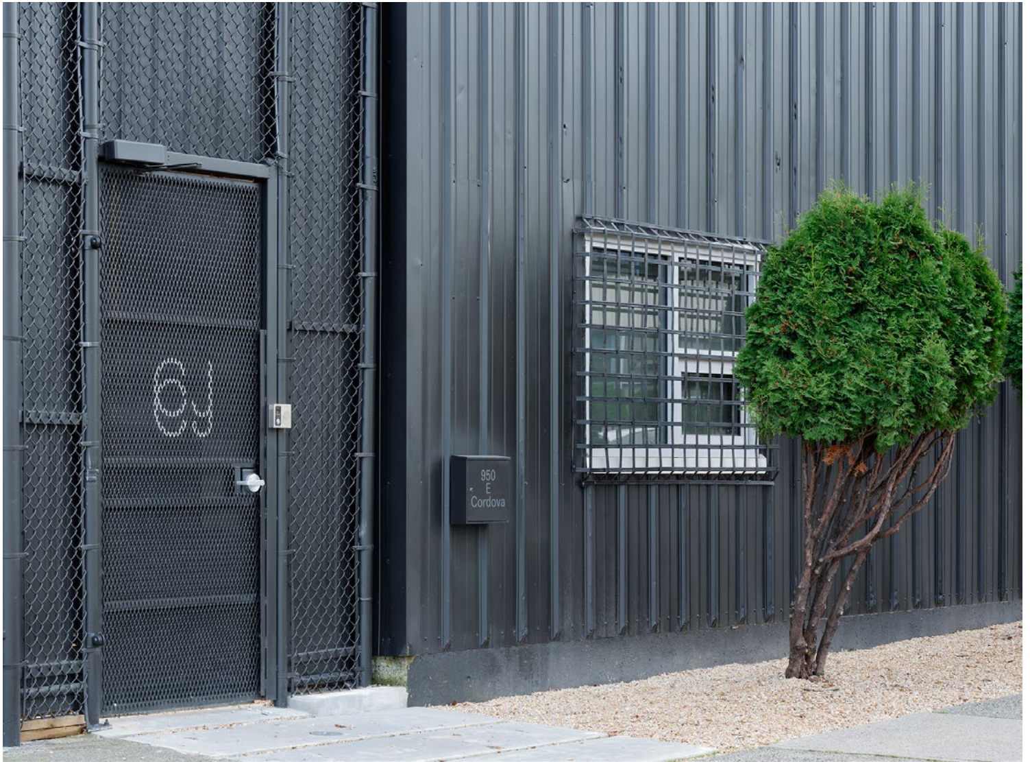
Abbas Akhavan Grille , 2019, painted copper, 57 x 81 in. (145 x 206 cm)