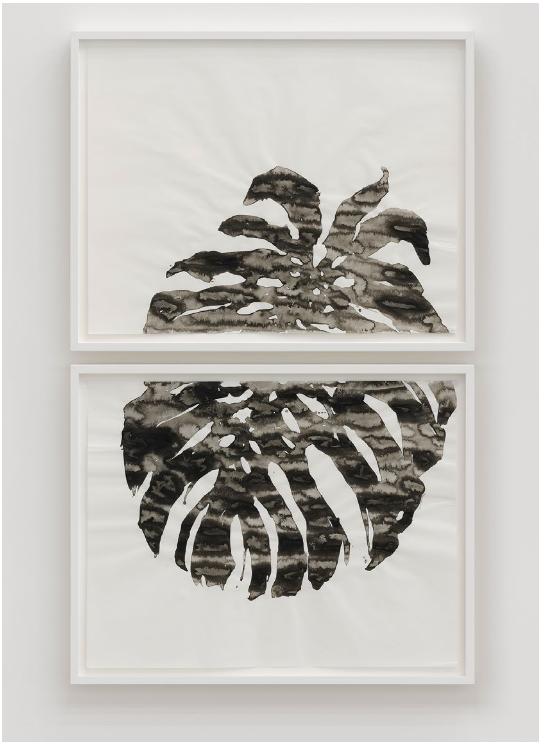
Abbas Akhavan Monstera deliciosa (studio) , 2017, ink on paper, diptych, each 22 x 28 in. (56 x 71cm)