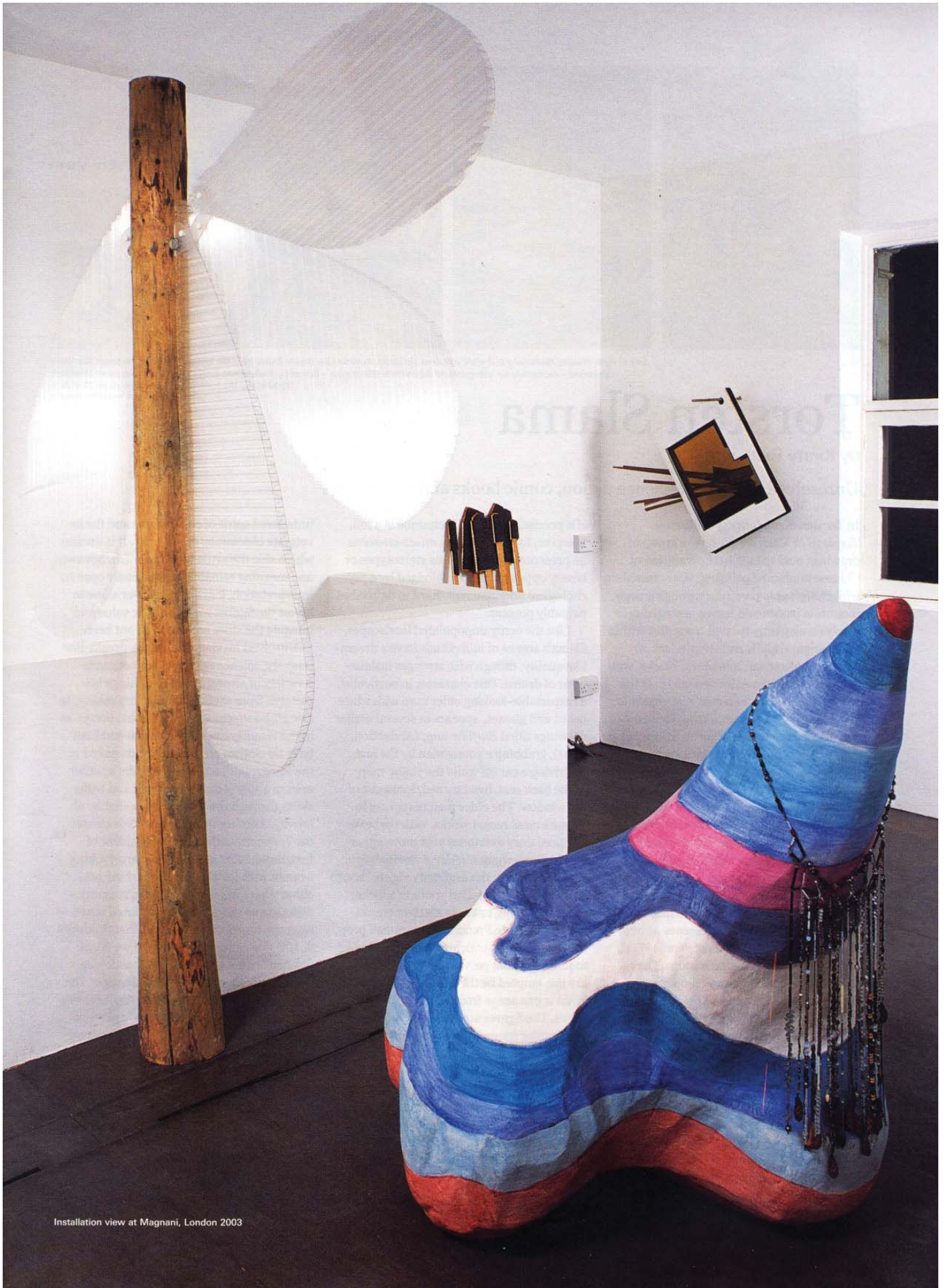
Installation view at Magnani, London 2003