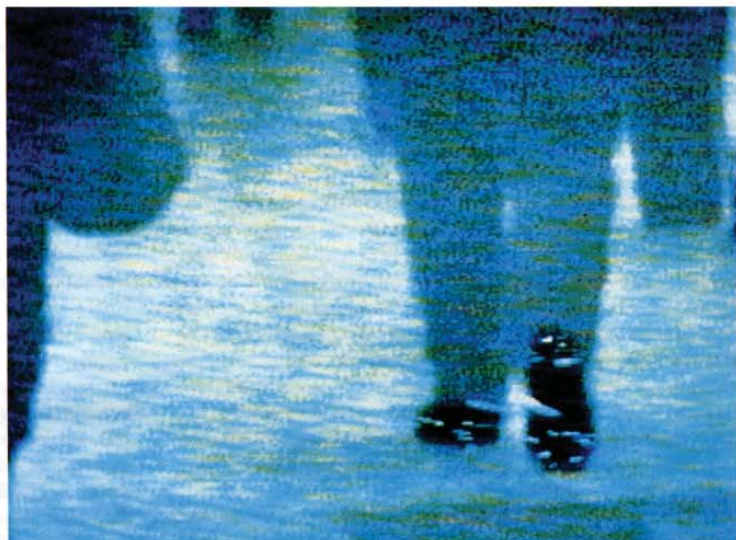
Left: Sunrise list (detail) 1987 Notebook and pencil 23x17cm Right: Breughel Boots 1999 Video still